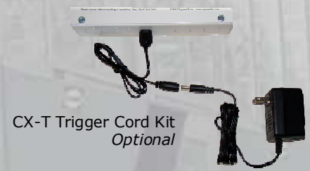
CX-T Trigger Cord Kit Optional

All outlets are energized by a single trigger input.